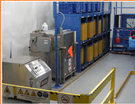
RNS-4 & BWC-2