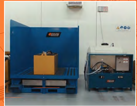
MWS-72 & RNS-1