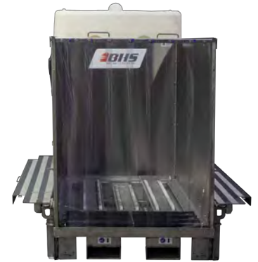
Side Steps fold down