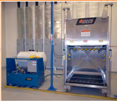
RNS-1 & BWC-2

Use a Recirculation/Neutralization System (RNS) in conjunction with your Battery Wash Equipment in order to create a closed loop system where battery wash water is contained, neutralized, and recirculated for reuse by the battery wash equipment.